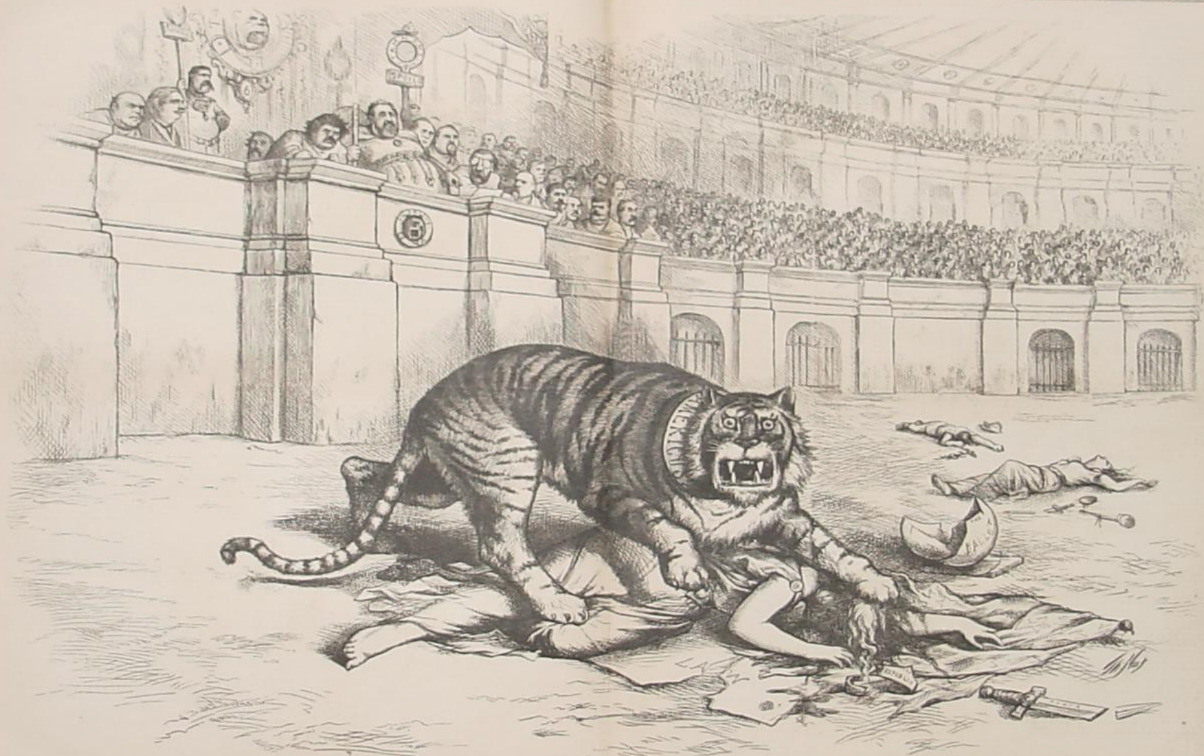
THE 'TAMMANY' TIGER LOOSE—"What are you going to do about it?"