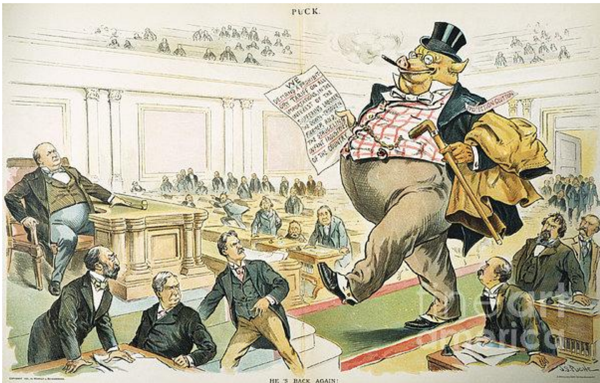
HE'S BACK AGAIN!