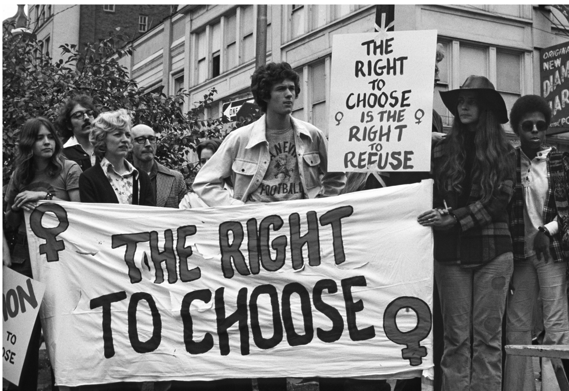
Barbara Freeman/Getty Images

Source: Image of a crowd at a reproductive rights demonstration, Pittsburgh, PA, 1974.