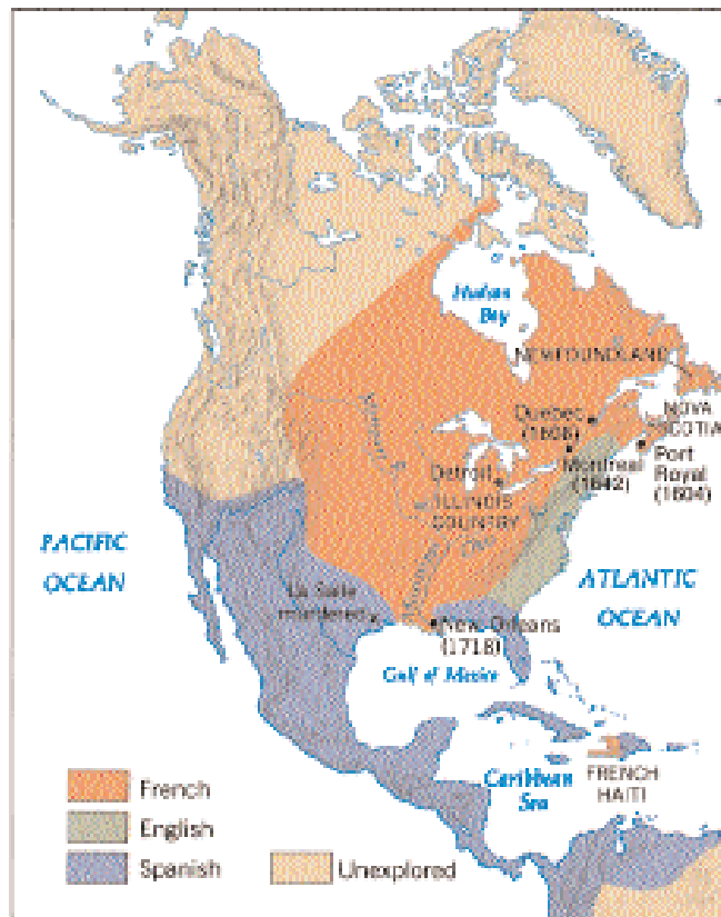
France's American Empire at Its Greatest Extent, 1700

Population in Catholic New France grew at a listless pace. As late as 1750, only sixty thousand or so whites inhabited New France. Landowning French peasants, unlike the dispossessed English tenant