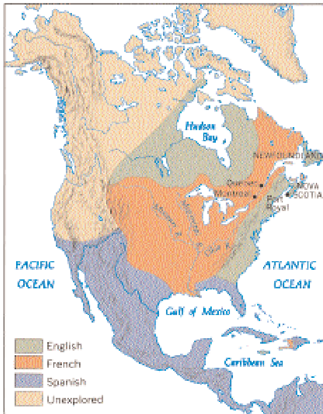
British Territory After Two Wars, 1713

Peace terms, signed at Utrecht in 1713, revealed how badly France and its Spanish ally had been beaten. Britain was rewarded with French-populated Acadia (which the British renamed Nova Scotia, or New Scotland) and the wintry wastes of Newfoundland and Hudson Bay. These immense tracts pinched the St. Lawrence settlements of