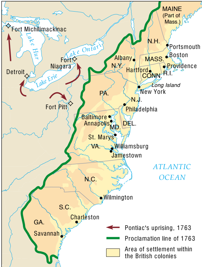
British Colonies at End of French and Indian War, 1763

This map, showing the colonies thirteen years before the Declaration of Independence, helps to explain why the British would be unable to conquer their offspring. The colonists were spreading rapidly into the backcountry, where the powerful British navy could not flush them out. During the Revolutionary War, the British at one time or another captured the leading colonial cities—Boston, New York, Philadelphia, and Charleston—but the more remote interior remained a sanctuary for rebels.