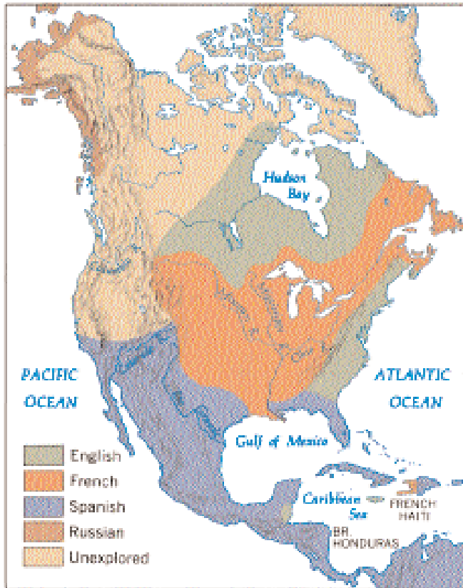
North America Before 1754