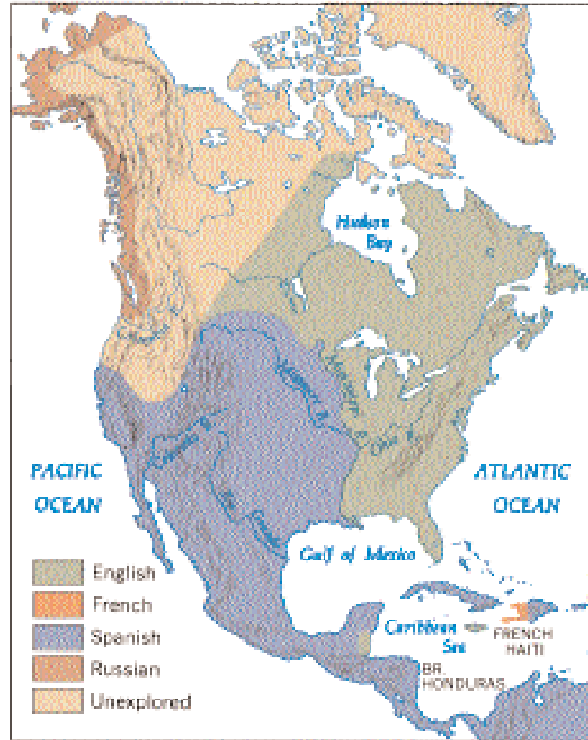
North America After 1763 (after French losses)

Wolfe, who had been an officer since the age of fourteen. Though slight and sickly, Wolfe combined a mixture of dash with painstaking attention to detail. The British attackers were making woeful progress when Wolfe, in a daring night move, sent a detachment up a poorly guarded part of the rocky eminence protecting Quebec. This vanguard scaled the cliff, pulling itself upward by the bushes and showing the way for the others. In the morning the two armies faced each other on the Plains of Abraham on the outskirts of Quebec, the British under Wolfe and the French under the Marquis de Montcalm. Both commanders fell fatally wounded, but the French were defeated and the city surrendered (see “Makers of America: The French,” pp. 118–119).