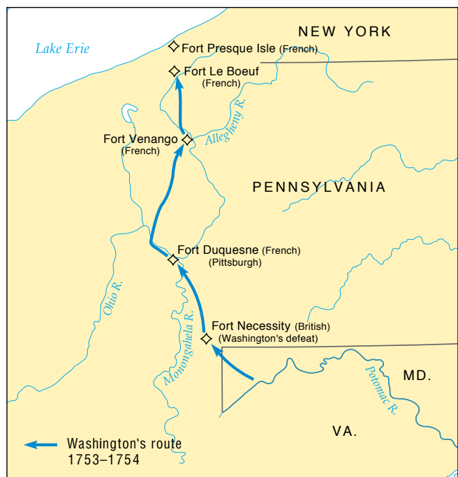
The Ohio Country, 1753–1754

Rivalry for the lush lands of the upper Ohio Valley brought tensions to the snapping point. In 1749 a group of British colonial speculators, chiefly influential Virginians, including the Washington family, had secured shaky legal "rights" to some 500,000 acres in this region. In the same disputed wilderness, the