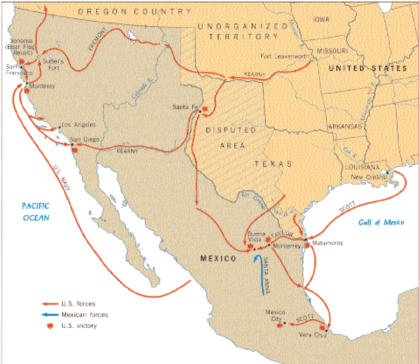
Major Campaigns of the Mexican War

upon the country by the shedding of “American blood upon the American soil.” A patriotic Congress overwhelmingly voted for war, and enthusiastic volunteers cried, “Ho for the Halls of the Montezumas!” and “Mexico or Death!” Inflamed by the war fever, even antislavery Whig bastions melted and joined with the rest of the nation, though they later condemned “Jimmy Polk’s war.” As James Russell Lowell of Massachusetts lamented,