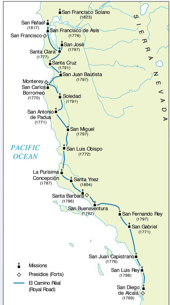
Spanish Missions and Presidios

By 1870 the Californios' brief ascendancy had utterly vanished—a short and sad tale of riches to